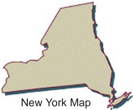
New York Map

C) This waterfall helps to produce electricity throughout the state of New York and is located near the northwest city of Buffalo N.Y. _____