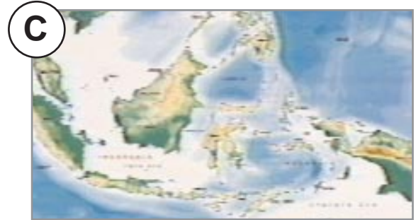
C) Map of Indonesian Islands.

DRAKE PASSAGE The: Drake's discovery of the southern tip of South America allowed ships to bypass the dangerous Strait of Magellan and navigate along calmer waters where the Atlantic and Pacific Oceans intersect.