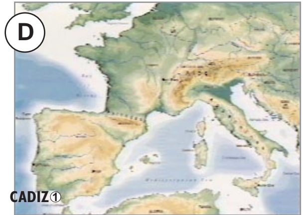
D) Map of Europe.

After leaving Nova Albion, (Drakes Bay) near San Francisco California, Drake and crew sailed 68 days across the Pacific Ocean to the Spice filled Islands of Indonesia.