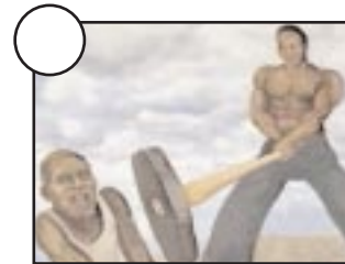
2.) PAUL BUNYAN- Lumberjack