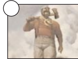
1.) POCAHONTAS - Indian Princess

The video mentions several legends. Write the number in the circle on the left hand corner of the picture to correctly match the name of the legend.