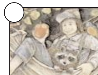
4.) JOHN HENRY- Mighty Laborer